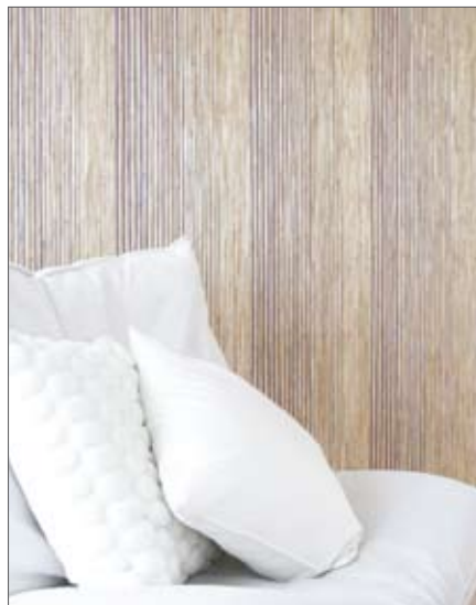
Gangar wall coverings, designed by Norway Says and manufactured by Biri Tapet