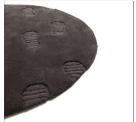
Giant Leap rug, designed by Permafrost and manufactured by Stories by Permafrost