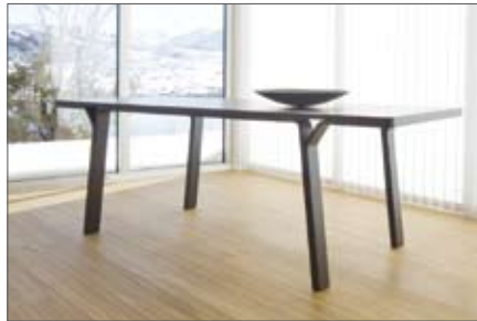
Nordica table, designed by Norway Says and manufactured by Fjordfiesta