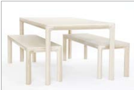
NORA dining table and benches, designed by StokkeAustad and manufactured by NORA of Norway