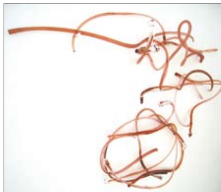
Cotton Candy art installation, designed and manufactured by Tanja Sæter