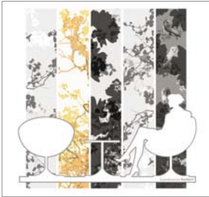
PanelPiece wallpaper, designed by Scandinavian Surface and manufactured by Photowall