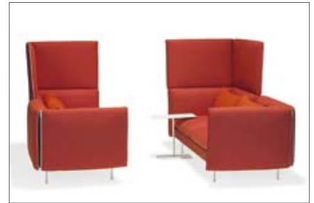
Duo sofa, designed by Norway Says and manufactured by LK Hjelle