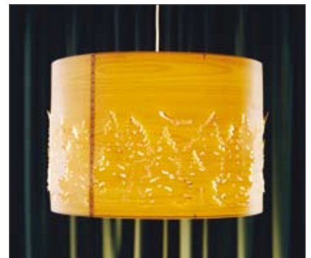
Norwegian Forrest lamp, designed and manufactured by Cathrine Kullberg