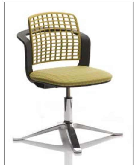
Sideways chair, designed by Formel Industridesign and manufactured by HÅG