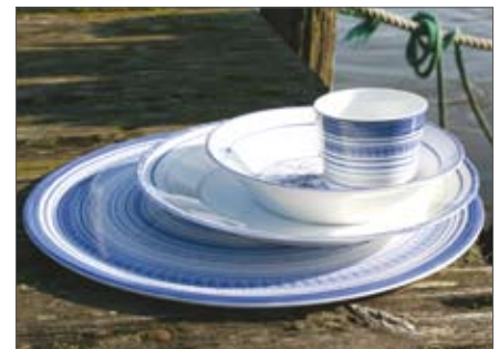
Blåne dinner set, designed and manufactured by Wik&Walsøe